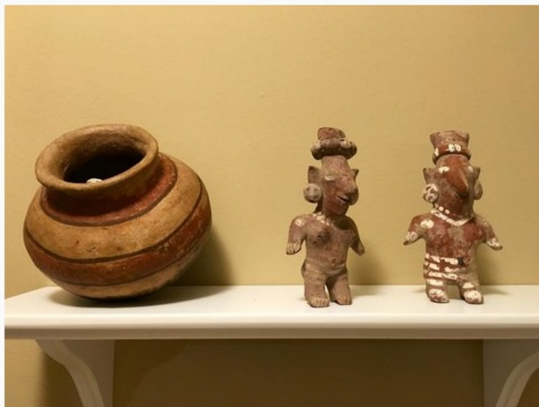
In addition to paintings, the Worthington Galleries collection also includes ceramics, ancient coinage, and ancient jewelry.

Pieces also include photographic art, ceramics, old books and manuscripts along with ancient coinage, ancient medals and jewelry made in approximately 1500 to 2000 B.C. There is also clay pottery from the Sumerian culture dating back to approximately 4,000 to 6,000 B.C.